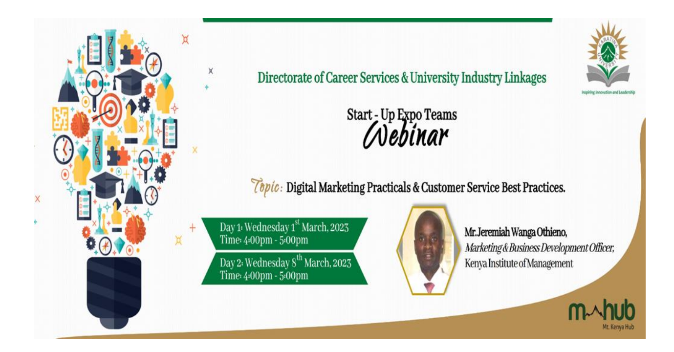
Appendix 3: Digital Marketing Skills Webinar E-Poster